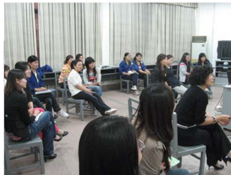
▲ Shared group experience