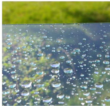
▲ Shower door after coating application