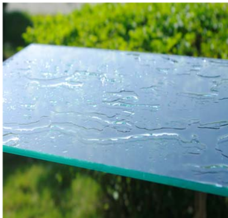
▲ Shower door without protective coating

We now are offering a permanent protective coating for shower door glass to reduce maintenance and cleaning. The coating uses the nano technology of an established company to create an invisible protective shield that chemically reacts with the glass to produce a permanent bond. Cleaning of shower doors becomes much easier and can also be less regular. Being factory-applied it offers cost savings as well while coming with a warranty.