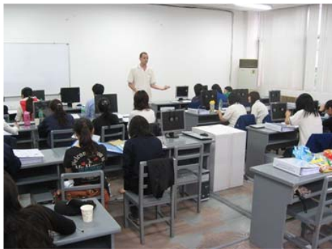
▲ Concentration on the lecture

The Intex group of companies continuously arranges training programs for its employees as part of its corporate culture. The photos below were taken during the most recent English language training for several people of the export administration department. The training aims to enhance the listening comprehension as well as the spoken English so they can communicate more fluently with customers.